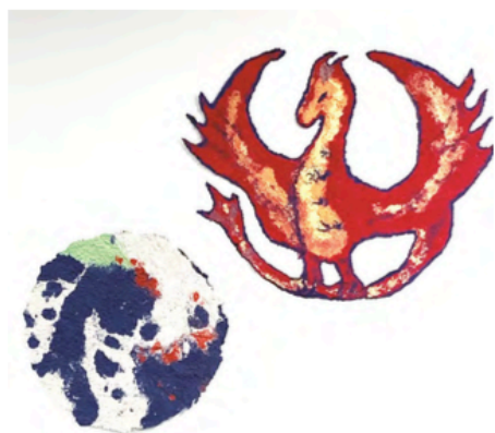
Brynnir: Fire Dragon 84cm w x 67cm h Global Hotspots 52x52cm

Starting with the huge world I made in 2020 as the central point, then the worlds in crisis and global hotspots on either side. On either side of these worlds I installed work about the forests and the subsequent work about marine pollution and sea creatures. Topping off both elements of fire and water, were two dragons, Hester the water dragon and Brynnir, the fire dragon. An exhibition celebrating the world through the freedom of freeform papers.